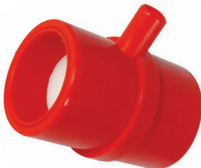
Nozzle with air- plug

Please inspect and decalcify the nozzle regularly !! Remove major cloggig using a pointed tool before decalcification.